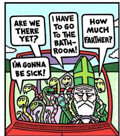
St. Patrick driving the snakes out of Ireland.

Exchange Bank & Trust 216 W. Riley Street Easton, KS 66020 (913) 773-5565 MyExchangeBank.com