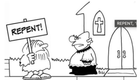
"Hey! – Go find your own corner!"

Exchange Bank & Trust 216 W. Riley Street Easton, KS 66020 (913) 773-5565 MyExchangeBank.com